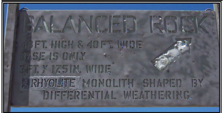
Balanced Rock before and after- top photo where Shawn and Brett used duct tape to correct the sign. A few months later, Shawn returned to the site only to find someone had permanently changed the sign to reflect the change!